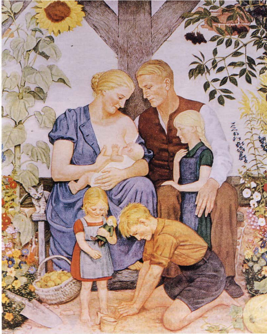
Source D In 1934 Hitler explained the official Nazi attitude to women in a speech to the National Socialist Women's section (NSF):

'If the man's world is the state, then the woman's is a smaller world. For her world is her husband, her family, her children and her home. The two worlds belong together as a man and a woman belong together. We do not consider it correct for women to interfere in the world of man. The National Socialist Women's movement has only a single point – the child.'